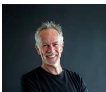
Brand and Advertising Strategist