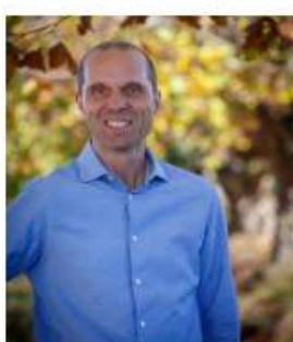
Professor Marketing Analytics Massey University