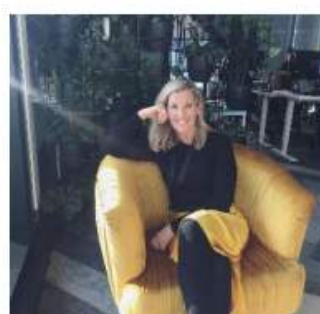
Head of Integrated Communications Anthem

Online and offline word of mouth: what it is, what it does, and how you can use it Thursday, 24th July, 5:30 - 7pm Massey University, Albany Campus, Room IC1.07